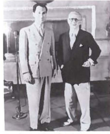
George Gershwin & Jerome Kern

A traveling exhibit about the contributions of iconic Jewish songwriters such as Jerome Kern, Irving Berlin, Richard Rodgers and Oscar Hammerstein. On display at the Reisterstown Road Branch, September 7 - October 21.